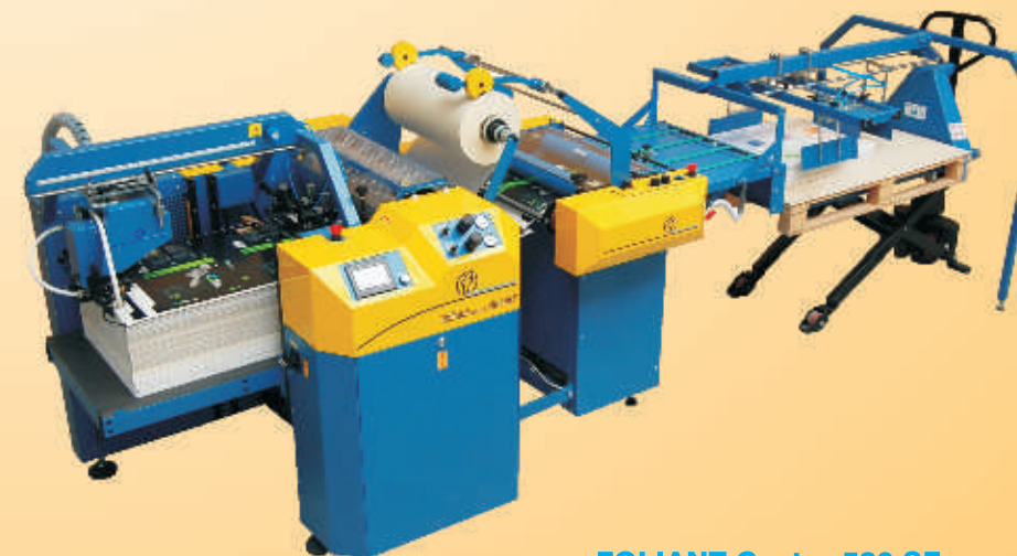
FOLIANT Castor 530 SF