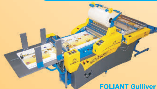
FOLIANT Gulliver C 520A