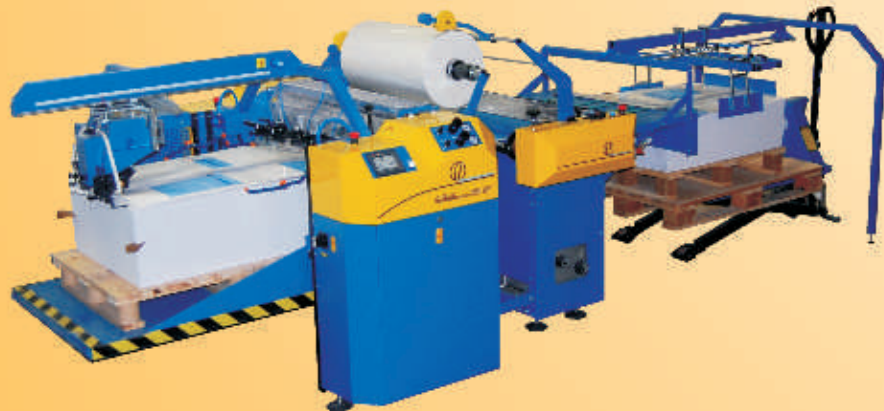
FOLIANT Pollux 760 SF