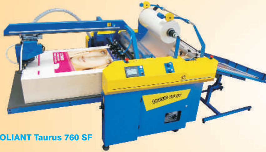
FOLIANT Taurus 760 SF