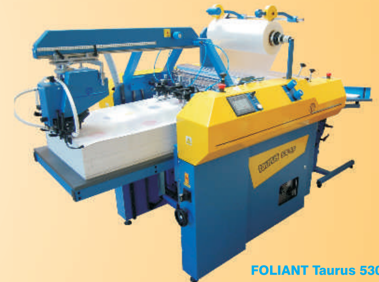
FOLIANT Taurus 530 SF