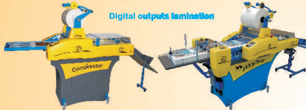
FOLIANT Gemini C 400S