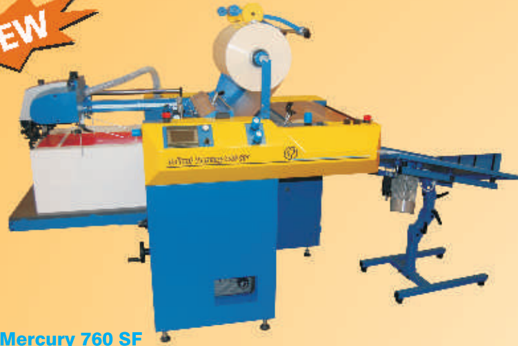
FOLIANT Mercury 760 SF