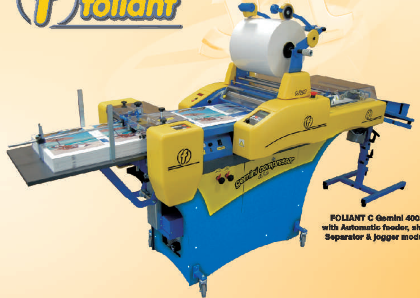
FOLIANT C Gemini 400A with Automatic feeder, sheet Separator & jogger module