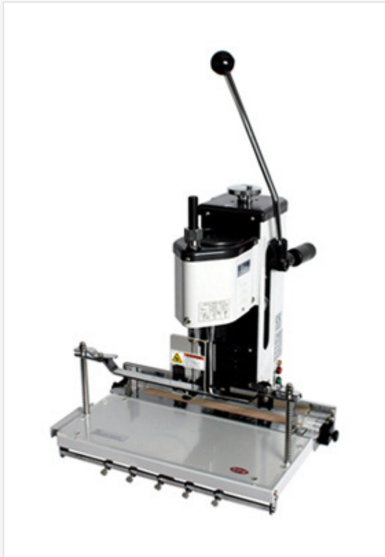
Model No. : F.P-III60(BS)