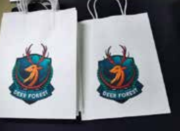
A3 Page Wide Printer