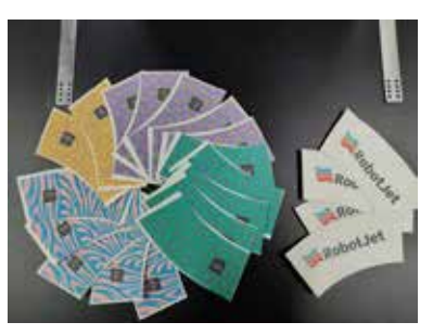
DISPOSABLE PAPER CUP